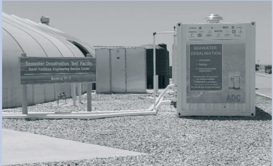
The ADC containerised demonstration system at the US Navy's Seawater Desalination Test Facility in Port Hueneme, California.

The plant uses an open intake off a pier in the Pacific Ocean. The feed water goes to an equalisation tank where it is then gravity fed to